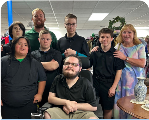
These students have proven to be a great help to our Yulee New to You Resale Store.

Donating your gently used items to Barnabas New to You Resale Stores does more than support our programs – it provides volunteer opportunities for our community members. We are proud to announce a new collaboration with a local initiative to help students with special needs enhance their vocational skills.