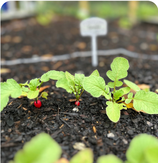
Our garden is growing potatoes, radishes, cucumbers, green onions and more.

The community garden features raised beds, a composting area and seating in the rear part of Barnabas Center’s property on Jasmine Street. It will provide a steady supply of fresh food to our food pantry and education in gardening skills, sustainable agriculture and healthy eating habits (in part with our diabetes self-management courses). It also serves as a therapeutic space fostering community collaboration.