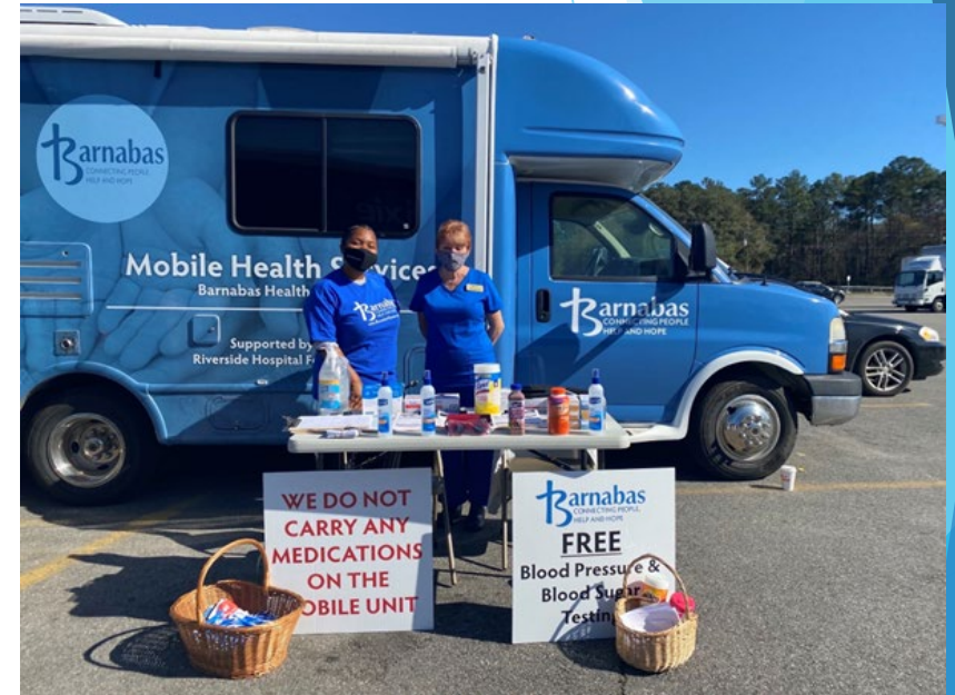
Barnabas Mobile Health Services van

The Yulee New to You location has provided a setting for clients in need of empowerment services to be seen closer to their homes.